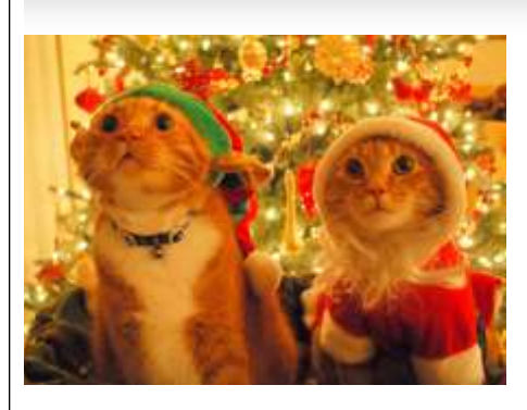
Q. Why does Santa Claus go down the chimney on Christmas Eve? A. Because it soots him.

It was Christmas Eve in at the meat counter and a woman was anxiously picking over the last few remaining turkeys in the hope of finding a large one.